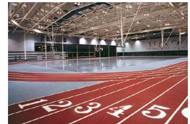
Fowler Center indoor track.