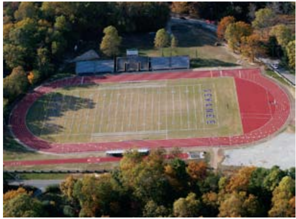
Sewanee's William Coughlan Track.